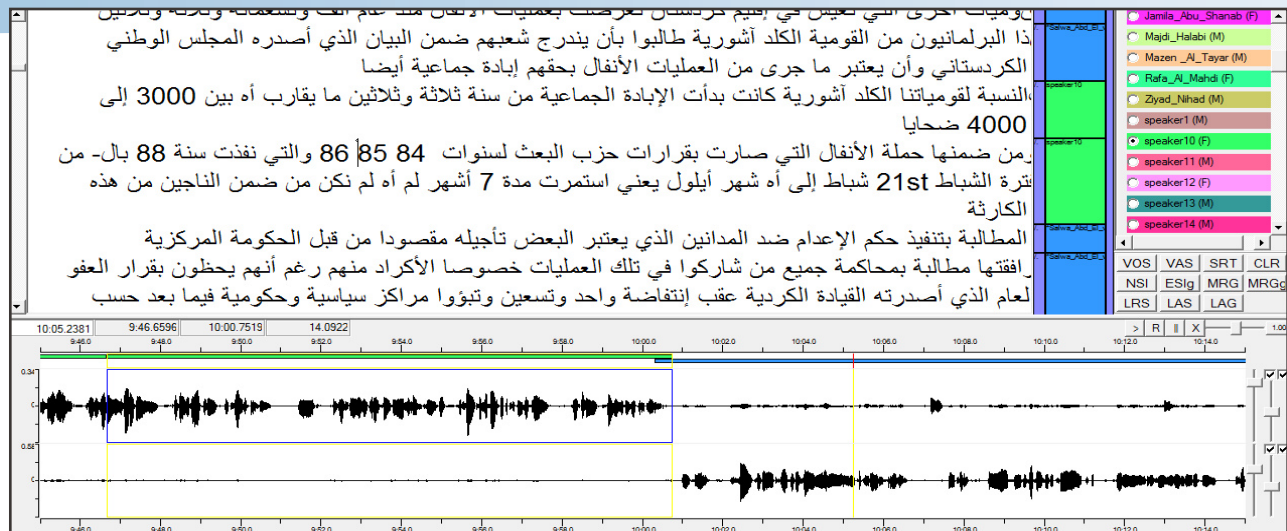
A screenshot of Arabic transcription involving multiple channels, overlapping speakers and bidirectional text